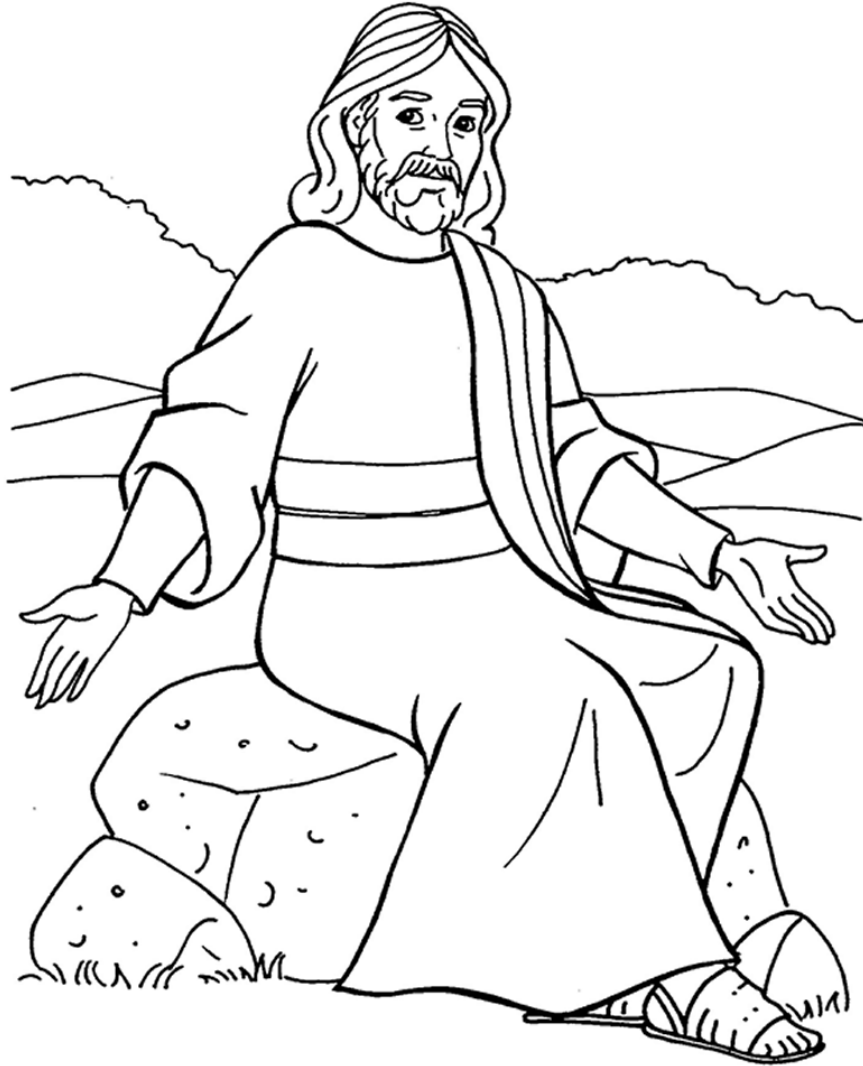
The Parable of the Weeds