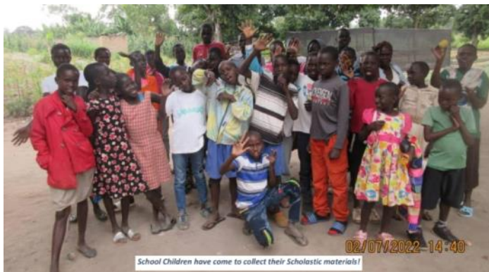
School Children have come to collect their Scholastic materials!