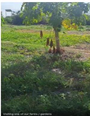
Visiting one of our farms / gardens