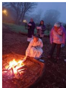
Dawn service @ St Michael's