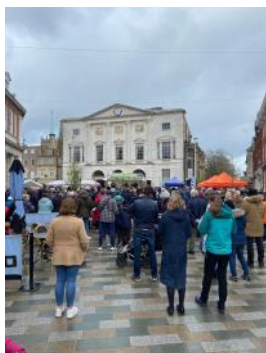
Walk of witness