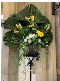
Floral display by Janet B