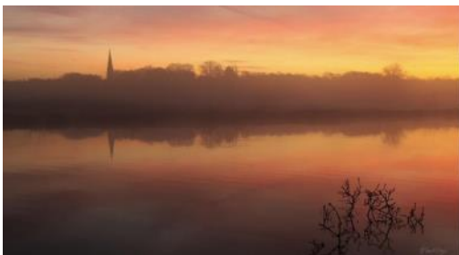
Awesome picture of St Mary's taken from Hylands park.

The next Messy Church will take place in the Church on 17th February, with a picnic lunch, the theme is Palm Sunday. Planning for this is on Monday 5th February at 12.30 in the Westland's Lounge.